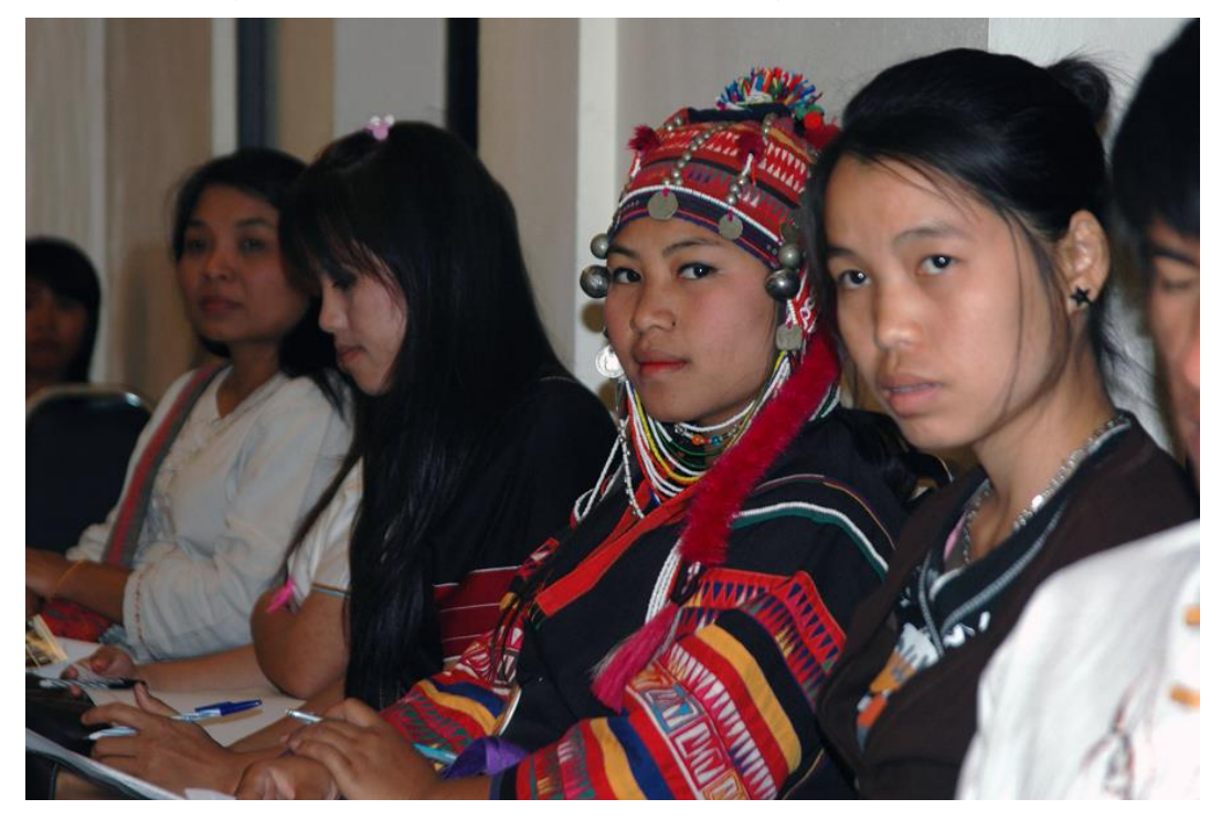
FIGURE 5: Highschool students attend the seminar "Living History of the Traditional Peoples" Tribal Wisdom School Symposium. (Chiang Mai Arts and Cultural Center; Chiang Mai, Thailand, 2010).

One weekend was devoted to artisan demonstrations, set in six traditional huts constructed on the museum grounds, where village craftsmen and -women from each group demonstrated the masterful artistry of their forebears: Lisu weaving and needlecraft; Hmong batik printing; Akha embroidery and instrument-making; Mien embroidery and basket-weaving; and Karen and Lahu back-strap weaving.