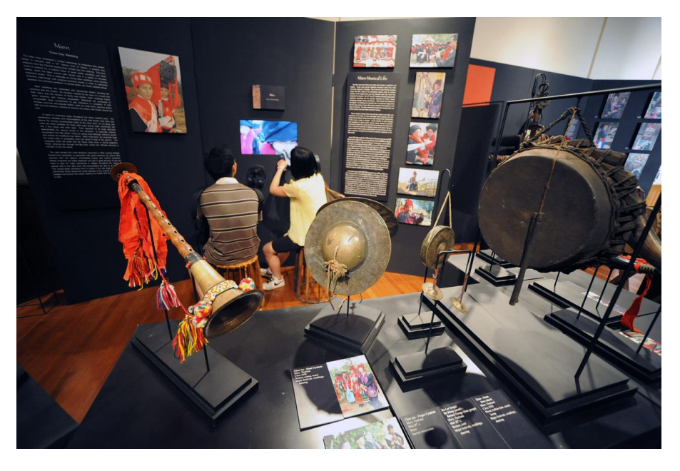
FIGURE 1: Visitors watch a Mien wedding ceremony, surrounded by Mien musical instruments ( Songs of Memory Exhibition; Chiang Mai Arts and Cultural Center; Chiang Mai, Thailand, 2010).

It is hoped that those who attend the Songs of Memory exhibition, and the accompanying presentations, demonstrations, and concerts, not only feel the music and ceremonies come alive, but also tap into the integrity and sophistication of the peoples who practice them. With over 130 groups and subgroups in the region, the Golden Triangle is truly one of the most culturally—and sonically—dynamic places on the planet.