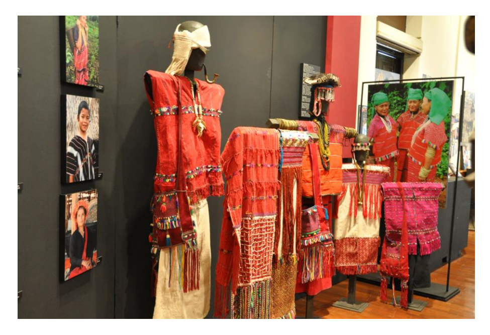
FIGURE 2: Traditional Garments of a Pwo Karen family. (Songs of Memory Exhibition; Chiang Mai Arts and Cultural Center; Chiang Mai, Thailand, 2010).

FIGURE 1: Visitors watch a Mien wedding ceremony, surrounded by Mien musical instruments ( Songs of Memory Exhibition; Chiang Mai Arts and Cultural Center; Chiang Mai, Thailand, 2010).