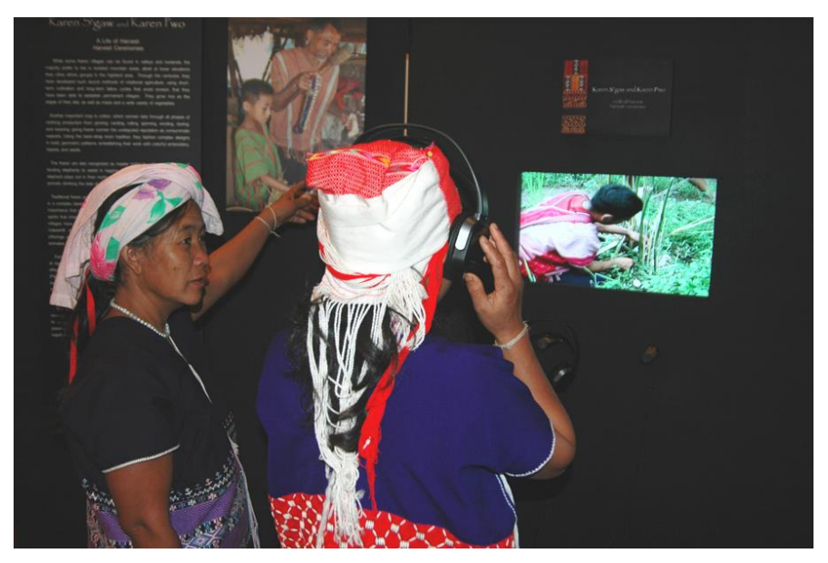
FIGURE 3: S'gaw Karen Women watch a documentary on the Karen Harvest Ritual ( Songs of Memory Exhibition; Chiang Mai Arts and Cultural Center; Chiang Mai, Thailand, 2010).

For descendants of the ethnic groups portrayed, whether they continue to live in their ancestral villages or have relocated, possibly to another country as immigrants or refugees, the materials will serve as a touchstone that honors their identity, a reminder of the physical, communal, and spiritual source of their forebears.