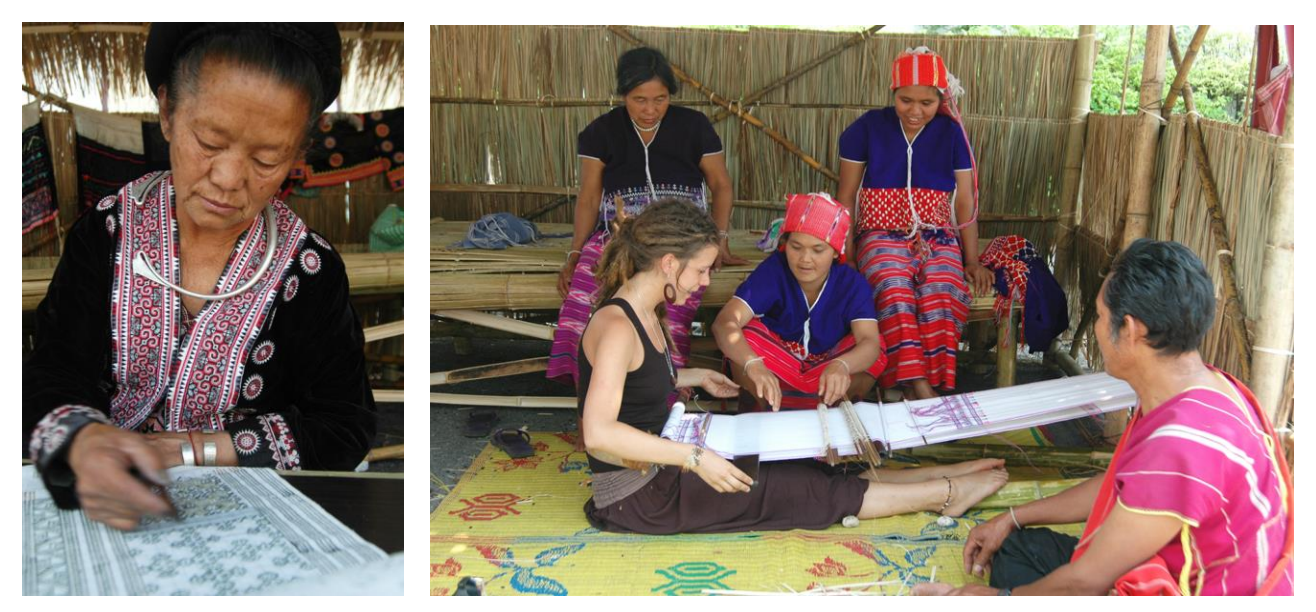
FIGURE 6: A Hmong woman displays her batik skills / S'gaw Karen women teach a guest the art of weaving. Artisan Demonstrations Tribal Wisdom School Symposium. (Chiang Mai Arts and Cultural Center; Chiang Mai, Thailand, 2010).

As curator and exhibition designer, it was my pleasure to offer frequent curator walks for museum guests, including a special showing of my film, "Threads of Memory," for the Chiang Mai Textile Society. Fourteen additional tours were given to school children, university students, and teachers from the following institutions: Chiang Daow, Ban Mae Angkang, and Prawe Wittayokom Schools, Rajabhat Chiang Mai University, and Sacred Heart College. Perhaps most moving of all was a tour for a class of at-risk ethnic girls, who had left their families to attend the New Life Center Foundation boarding school. They expressed how the exhibit "helped them learn about their own culture."